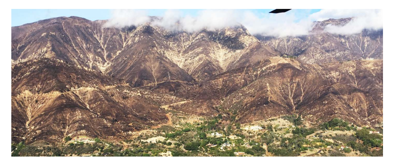
Figure 1. Scarred hillsides from recent wildfire