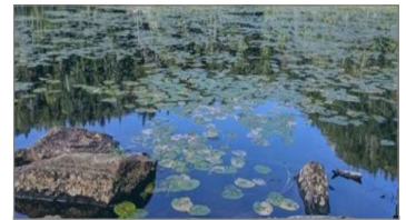
Wetland Managers Workshops

Typical projects previously selected for ASFPM Foundation funding are illustrated above and include: