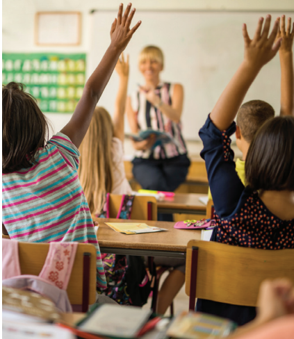
The ASFPM Foundation completed the K-12 Flood Education Resource Report in 2017.