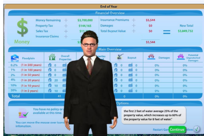
Screen shot of flood manager game