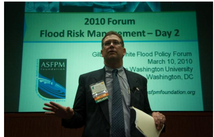
2010 Forum

A full report, action agenda, and recommendations for further research will be released late this year. For now, anyone can peruse the background reading, PowerPoint presentations, agendas, and assembly participants (as well as those from the two formation symposia that preceded it) at www.asfpmfoundation.org/2010forum.htm .