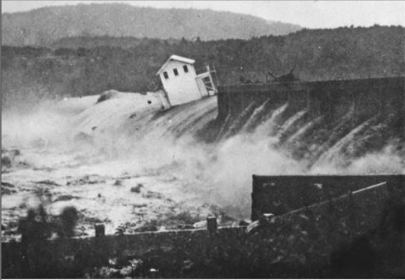
Figure: 1935 Flood - Austin, Texas Courtesy of Austin History Center, PICA 008484-A